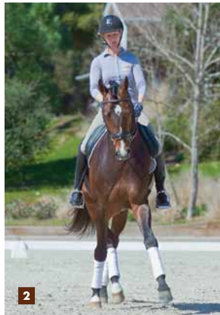
I like this pattern for developing flexibility in a horse. Bending loosens the horse's body just as side stretches do for us. 1. Start at trot on a 10-meter half circle to the centerline. 2. Leg yield to the quarterline.

exercise will give you tools to straighten your horse and engage his hind legs. I call it a leg yield only because it follows a forward-sideways pattern similar to