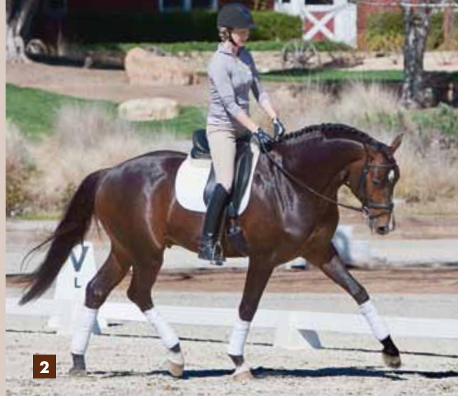
To improve Losgelassenheit, you can use stretching forward and downward both as a test and as a tool.